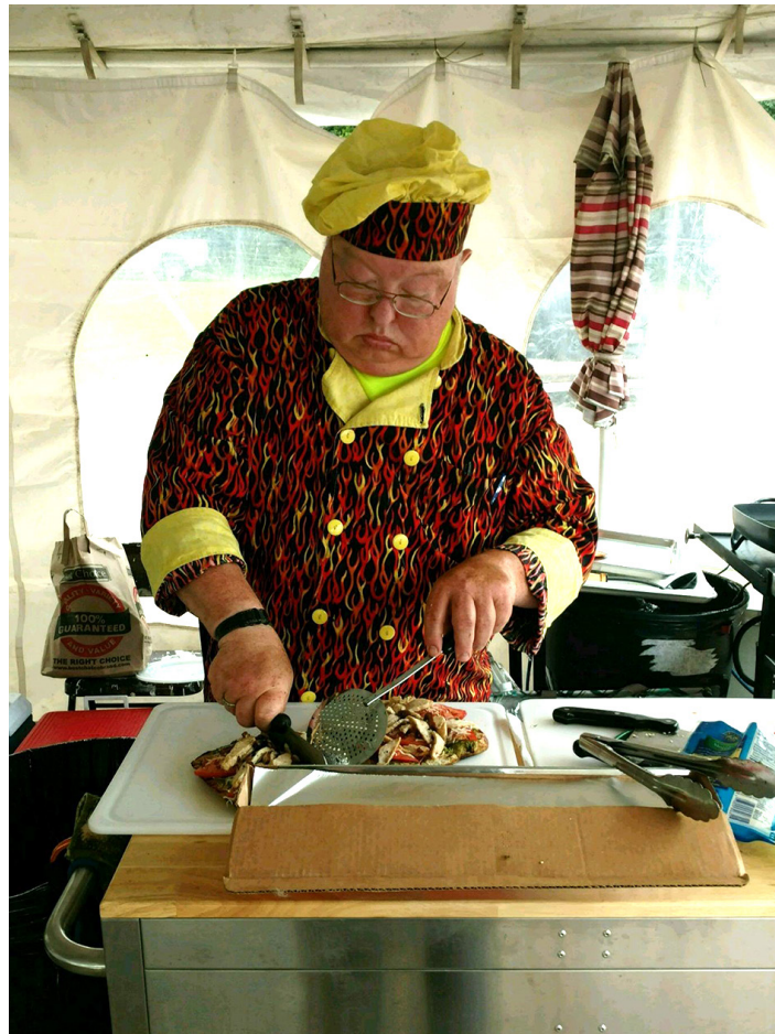
Top: A chef prepares lunch items using winter camelina oil during a June 27 open house at the Agricultural Utilization Research Institute in Waseca. Bottom: The camera phones came out for a demonstration of an oil press producing cold-press oil and a protein-rich meal from winter camelina June 27 at the Agricultural Utilization Research Institute in Waseca.