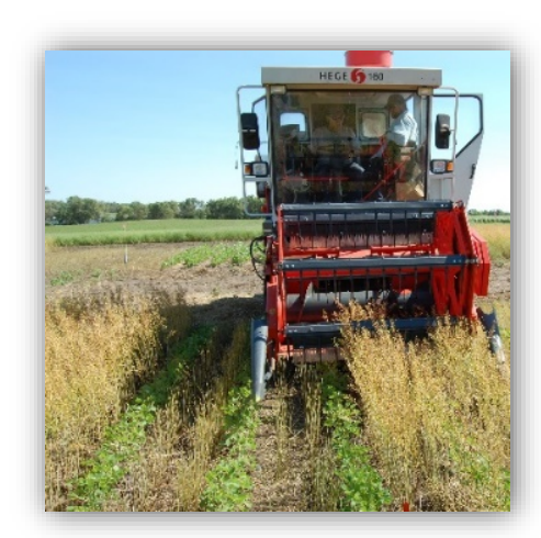
Winter camelina harvest.