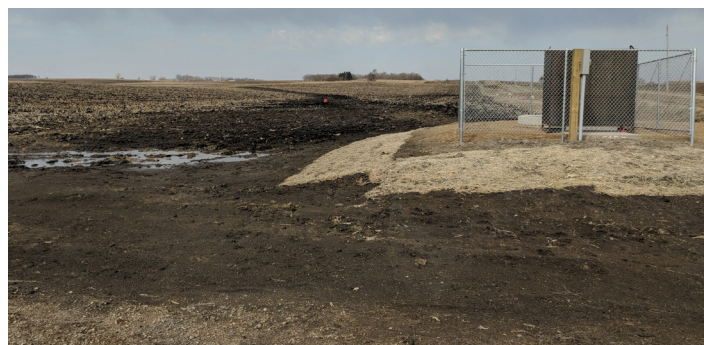
On Stan Gorecki’s 60-acre RIM easement, Area II helped to design and install a pump station that lifts water 12 feet from tile that’s part of Lincoln County Ditch 37.

Sterzinger described the wetlands today as full of water and fully functional, with the overflow running as designed. Grasses are still dormant at this point, but when the native species mix flourishes, the grasses, shrubs and conifers will provide cover for wildlife.