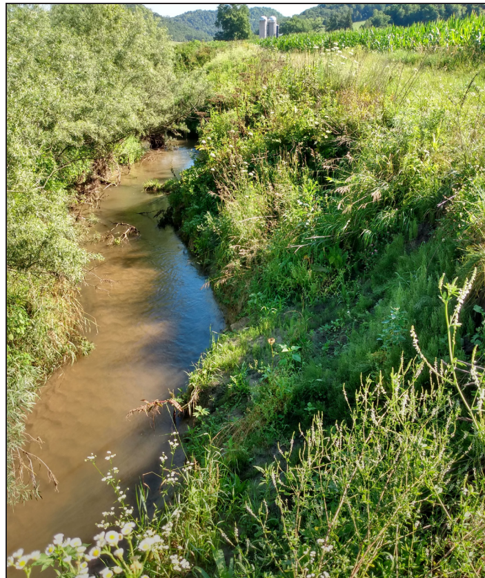
A designated trout stream, Campbell Creek is a direct tributary of Money Creek, which will benefit from forest stand improvement within the watershed.