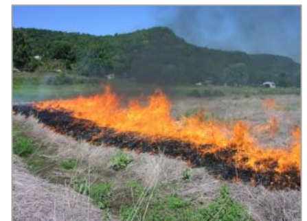
Prescribed burning to control woody plants in a wetland restoration

Prescribed burning is beneficial to remove thatch, control invading woody and invasive plants in wetlands, prairies, and savannas, fertilize the soil with ashes, stimulate seed germination and new plant growth, and increase diversity in plantings. Some practitioners feel that burning may increase reed canary grass in wet meadow plantings where the species is a threat, likely due to added nutrients and light levels promoting germination (fall burning may have less benefit for invasive species). Other rhizomatous species may also be stimulated by burning, so other management methods (e.g., herbicide application, grazing or mowing) may be needed after burning. Burning is typically initiated after the third or fourth years of establishment, after native vegetation is reaching maturity. Uplands benefit from burning every three to five years. Fall and spring burns should be alternated periodically to simulate natural variation. Burn plans are needed to define the details of how the burn will be conducted, who will be involved and for contingency planning. In many cases, permits are also required.