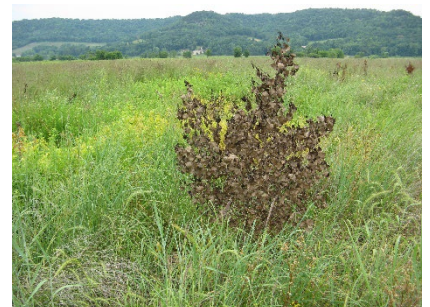
Cottonwood treated with herbicide

Tree and woody brush control is often needed in restoration of prairie and open wetland plant communities. Tree control in the prairie region of Minnesota is a common practice to improve habitat for ground nesting grassland birds. Methods of control include prescribed burning; mowing/cutting; mowing/cutting followed by stem herbicide treatment or basal herbicide treatment; foliar herbicide treatment; hand-weeding and/or grazing. The method that will be most effective in a certain situation will depend on site conditions, size of woody plants, density and timing. Prescribed burning in the fall and mowing with a flail type mower (leaving the cut surface rough vs. a clean cut) in late summer are generally the most cost-effective methods for smaller trees and shrubs.