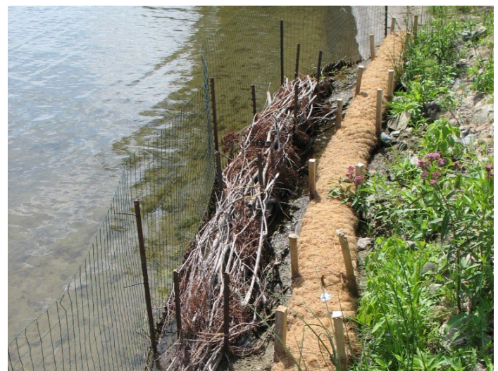
Shoreline restoration using wood mulch, coconut fiber bio-logs, wattles and fencing