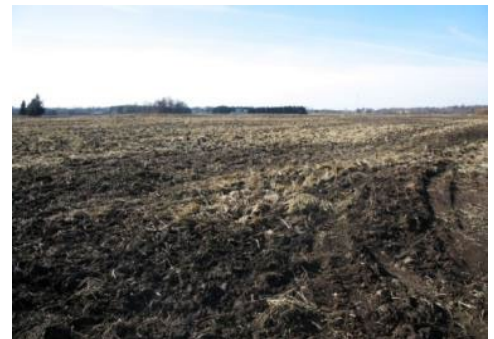
Field prepared for broadcast seeding

Effective site preparation is essential to getting a conservation practice or restoration project off to a good start as well as for long term success. Primary goals of site preparation are to control weed species and to provide ideal growing conditions for the seed or plants to be installed. Site preparation methods vary depending on past uses of the site and the weed species that are present. Protecting microorganism populations and native seedbanks, preventing soil erosion, and managing weed establishment are all considerations during the site preparation process. In most cases, non-herbicide methods are preferred over herbicide intensive methods to protect aquatic organisms and soil microfauna, but herbicides may be the most efficient method of controlling large areas of some invasive perennial species.