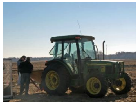
Broadcast seeder being used to seed a wet meadow restoration