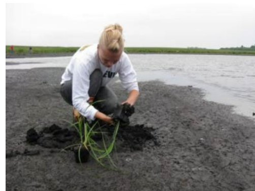
Planting of emergent plants on the edge of open water

It is recommended that aquatic plants be installed in May or June; recent research and project experience has shown this to be the best time for establishment. Late summer plantings seem to have lower survival rates. Install emergent plants at a depth where they will not be covered with standing water. Waves may also influence plantings, particularly on east shorelines, so it may be beneficial to plant some emergent species a little further up slope from the open water edge to aid establishment. Wave break structures, wattles, or coconut fiber logs can be used to minimize wave damage. Temporary fencing may be needed for projects where waterfowl or muskrats may graze young plants; in some cases this can be as simple as flagging tape attached to stakes to deter waterfowl or installing snow fence. Watering may be needed in drought conditions.