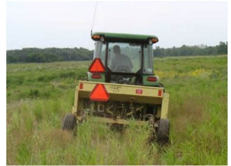
Inter-seeding forbs into native grasses to increase diversity

Site preparation generally involves the removal of thatch through burning or haying to provide light for seedlings. Weed removal through herbicide treatment is sometimes needed to decrease competition and open areas for establishment. Alternative methods are to cultivate nodes or use solarization with plastic within larger areas for seeding. A year or longer may be needed for site preparation if perennial weeds are dominant.