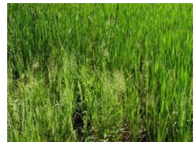
Slough grass established as a temporary cover crop

The use of short-lived temporary cover crops helps stabilize project sites and minimize the need for additional mulch when preparing to plant native seed mixes. They can also provide time to observe weed problems and to allow for proper weed control before fall seeding. If cover crops are seeded at the same time as the native species, they can act as a germination indicator, since they grow faster than the native species and show that the seeding was successful. Temporary cover crops such as oats or winter wheat (the two species most commonly used) should be mowed to 10-12 inches before seeds mature (or harvested upon maturity) to prevent re-seeding. Slough grass is a common cover crop for wet areas. Annual rye grass was commonly used in the past but is now generally avoided due to its ability to inhibit germination of native species. Perennial species are discouraged as temporary cover crops, as they require herbicide application before conducting seedbed preparation and seeding. Other cover crops typically used in agricultural fields, such as buckwheat, pennycress, and radishes, can help stabilize soil, build soil quality, or provide weed competition as part of restoration projects. See NRCS Agronomy Technical Note 31.