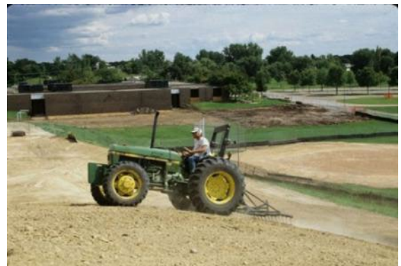
Harrowing to prepare for seeding

Methods that are used to prepare a seedbed can vary depending on the type of seeding equipment to be used. If a traditional native seed drill will be used, a smooth, firm seedbed is required. Soybean fields generally are sufficiently prepared for a native seed drill, but sites that were recently tilled will require additional soil treatment such as harrowing and rolling to prepare an adequate seedbed and prevent seed from being buried too deep. Broadcast seeding can be conducted on soybean or corn fields, or fields that have been disked, if the soil is allowed to settle before seeding. Some practitioners have found that broadcast seeding on a smooth