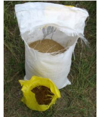
Wetland grass, forb, sedge and rush seeds

Seed mixes for projects can include seed collected from the project site, or nearby natural areas, State seed mixes, private vendor mixes, or custom mixes developed for site conditions. State seed mixes have been developed for a variety of project types including wetlands, prairies, forest edges, roadsides, riparian areas, and stormwater treatment systems. These mixes have been designed to increase diversity, create competition for invasive species, and promote plant community resiliency. Single-species cover crops are not recommended in addition to permanent state seed mixes, as they already contain oats or winter wheat (depending on the season of planting). State seed mixes are available on a BWSR webpage