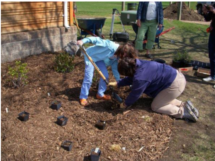
Raingarden where mulch has been applied before planting to prevent compaction

For sites where containerized plants will be installed, a firm, weed-free surface is desirable to aid planting efforts and to ensure that soil will not bury seedlings after rainfall. For raingardens, shredded hardwood mulch is often applied before planting containerized plants to prevent compaction of the soil during planting. Shoreland plantings commonly use wood mulch or erosion control blanket to suppress weeds, retain moisture, and stabilize soils. Shoreland plantings may also use bio-logs, wattles or wave break structures to decrease wave energy and to hold upland soils in place while plants establish. On flat or moderately sloped sites, a light layer of prairie straw (available from some native plant companies) or weed-free straw can be used as mulch to help retain moisture and suppress weeds. On some shoreline and upland sites, fencing, repellents, and/or tree/shrub protectants may be needed to prevent animal herbivory until plants are established.