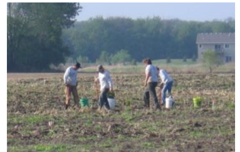
Planting seedling trees and shrubs

Planting 200 to 400 seedling trees or shrubs per acre is recommended for upland and wetland forested communities and shrub wetlands. Spacing should depend on the size of plant material, seedbank of woody species, potential for colonization, expected aftercare, and potential losses. It is not uncommon to lose between 25-50% of seedling trees and shrubs or cuttings. Nursery grown plants may not do well when planted in saturated soils, so planting on mounds or berms (1-2 feet tall) can be helpful. The seeding of trees and shrubs has become a more common practice to plant large areas. Thorough site preparation and weed control is needed for seeding trees and shrubs, similar to methods used to prepare and maintain prairie plantings. Transplanting young trees and shrubs from project areas where there is dense establishment can also be a successful restoration strategy.