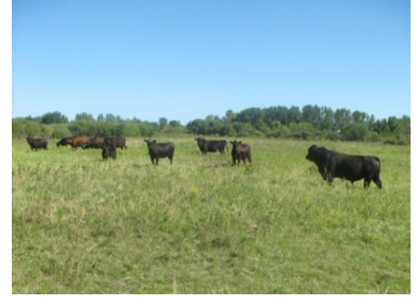
Cattle grazing reed canary grass in a restored wetland

Conservation grazing is conducted by a variety of species, including cattle, bison, horses, sheep and goats, to target specific invasive plants and non-native species or to replicate natural grazing regimes and promote nutrient cycling and species diversity. For example, early spring grazing by cattle has been used to control Kentucky bluegrass in prairies, while later spring grazing has been used to control smooth brome grass. Goats have also been used for the management of buckthorn and non-native honeysuckles, as they eat a variety of woody plants. Detailed grazing plans are an important component in the planning and implementation of prescribed grazing. Grazing plans should include objectives and information about timing, potential disturbance, herd size, fencing and water sources. See https://bwsr.state.mn.us/sites/default/files/2019-01/6A-5%20Conservation%20Grazing.pdf