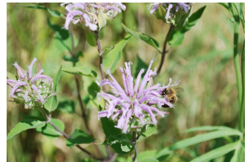
Native bee on wild bergamot

Pollinator seed mixes typically include greater than 30% forbs by seed count for large areas and over 50% for smaller pollinator plots/zones of a few acres in size. It is important to thoroughly control weeds before seeding through methods that will decrease the weed seedbank. Organic site preparation methods should be the first priority. It is also important that pesticides that persist in the soil were not used prior to seeding. The persistence of individual pesticides need to be investigated if they were used. Seed should be dormant seeded in late fall when possible to allow forb seed to stratify over winter and be ready to germinate in the spring. Forb species are sometimes planted in masses to make them easier for pollinators to find and to decrease travel distance. Broadcast seeding or seeding with a native seed drill should be conducted followed by rolling to improve seed to soil contact and prevent erosion.