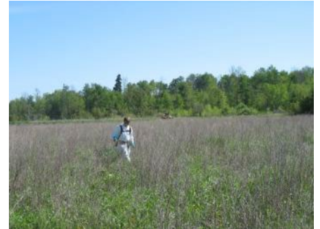
Spot herbicide treatment of reed canary grass

Problematic perennial weeds that cannot be managed effectively with other methods may require spot treatment with herbicide for sufficient control. Examples include reed canary grass, smooth brome, quack grass, purple loosestrife, Canada thistle, Kentucky bluegrass, crown vetch, and birds-foot trefoil. In some cases, site-level herbicide treatment is avoided during the first or second year of establishment to avoid impacts to seedlings but spot treatments can be used to control some weeds before they have a chance to spread. A common practice for Canada thistle control involves clipping seed heads while they are in the bud stage (usually early June) and applying a broad-leaf specific herbicide in the fall (mid to late October). This timing limits the application of herbicide while pollinators are active.