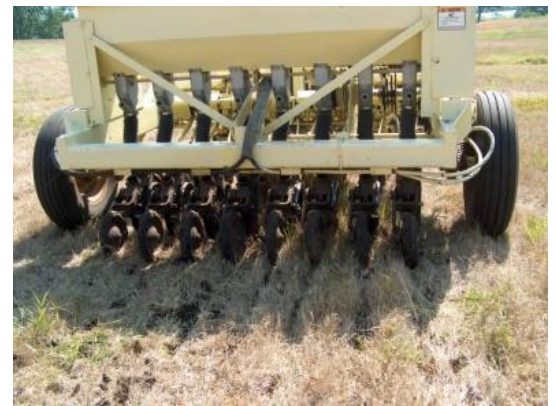
Native seed drill

Upland prairies, savannas and woodland edges are most often restored through the installation of seed. A variety of seeding equipment is used for upland seeding including broadcast seeders, traditional native seed drills, no-till drills, Brillion seeders and Trillion seeders. Specialized no-till grass drills are designed to handle a wide variety of seed (fluffy, smooth, large and small) and low seeding rates. Since no-till drilling can plant directly into a light stubble layer, this method reduces erosion on the newly seeded site. Conventional grain drills are not capable of handling diverse seed sizes and are unlikely to provide satisfactory results. While no-till native seed drills can plant through light stubble, success is still likely to be greatest when most excess residue is removed.