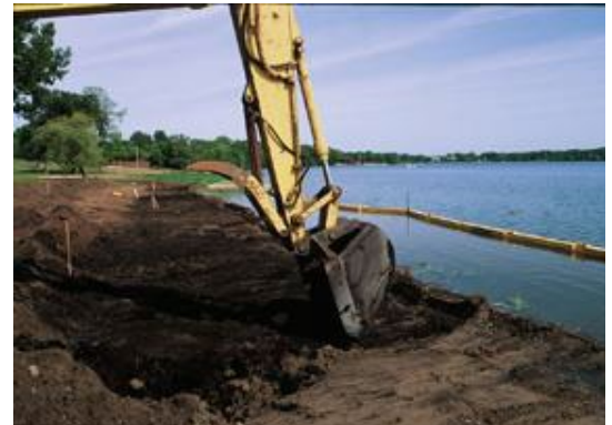
The removal of fill as part of a shoreline restoration project

Scraping with backhoes and bulldozers is sometimes conducted to remove species such as reed canary grass and giant reed grass, or to remove fill materials or sediment that has deposited in wetlands or along shorelines. Sediment removal can be expensive and there must be a plan for the disposal of scraped material. An advantage of sediment removal is that it can remove accumulated nutrients and expose remnant native seedbank. Shallow scraping, mechanical raking or brushing, or other means to remove the duff layer from a site can also aid in control of species such as cattails, giant reed grass and reed canary grass.