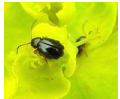
Leafy spurge bio-control beetle

Biological control is an effective management tool for large infestations and environmentally sensitive areas. Biological control agents are currently being used for purple loosestrife, leafy spurge, Canada thistle, common tansy, and spotted knapweed and they are in development for several other species. State or federal agencies should be contacted for recommendations on obtaining bio-control agents. Other practices such as mowing, prescribed fire, grazing, and inundation can influence bio-control agents, so their use should be part of a comprehensive management plan.