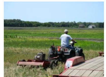
ATV used to mow Canada thistle before flowering

Mowing of annual and biennial weeds is also beneficial in wetland transition areas for species such as giant ragweed, barnyard grass, and Canada thistle, but should only be conducted if rutting and soil compaction will not result. Pressure from annual and biennial weeds is generally less with increased soil saturation and water depth. For smaller projects, brush cutters, string trimmers, or hand equipment can be used to target weeds and work around native plants. See the Minnesota Wetland Restoration Guide appendix 6, mowing: https://bwsr.state.mn.us/sites/default/files/2019-01/6a-3%20Mowing2.pdf