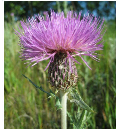
Flodman's Thistle, with white stem & large, solitary flower head.

The quickest way to distinguish native thistles from non-native thistles is to grab hold of the stems! Or, looking will work just as well, and it'll be a lot less painful. None of MN's native thistle species have spiny-wings along the stem, and most non-native species do. The only non-native species that does not have spiny wings along the stem is Canada Thistle. This species is one of only two colony-forming (spreading by rhizomes) perennial thistles in MN. The other perennial thistle is the native species Flodman's Thistle, which can easily be distinguished from Canada Thistle by the white and wooly appearance of the stems and lower leaf surfaces.