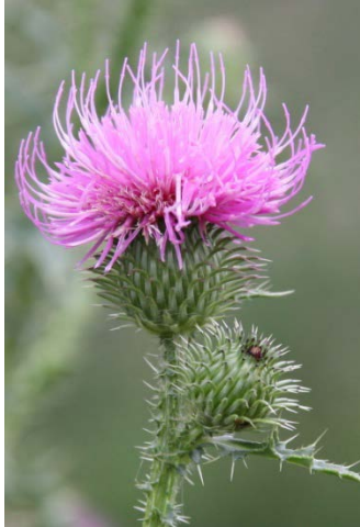
Plumeless Thistle, showing spiny stem. Flower heads are smaller & more numerous than Bull Thistle.

The most common native thistle is called Field Thistle. This often gets mistaken for Bull Thistle, but like all native thistles it does not have spiny wings along its stem. Field Thistle also has several small leaves right below the flower head, which Bull Thistle does not have.