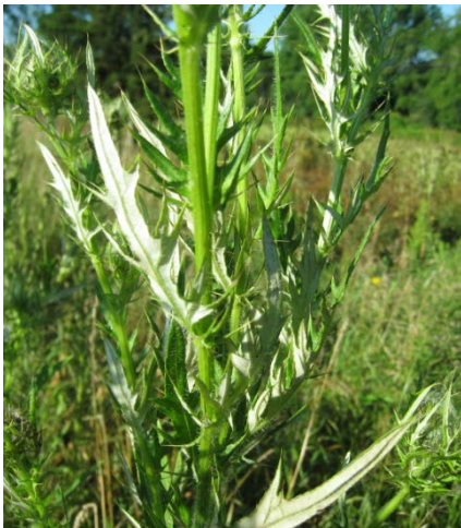
White on the lower leaf surface is more common on native species, such as this Field Thistle.

To control the biennial thistles, it's important to understand that they're biennial and become established by exploiting a bit of bare soil. Killing the thistles alone will only leave bare soil again, which is sure to be filled by replacement thistles or some other weed. Correcting the cause of the bare soil