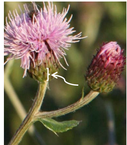
Canada Thistle, with greenish stem & small, clustered flower heads.

Two other important look-alikes are the native Swamp Thistle and the non-native European Marsh Thistle. Watch out for European Marsh Thistle. Although not known to be in MN, it is currently invading sedge meadows, bogs, and even cedar swamps in the Upper Peninsula of Michigan and northeast Wisconsin. These two are the only biennial thistles that will grow exclusively in wet areas. The key differences are that the native Swamp Thistle has smooth stems and the non-native European Marsh Thistle has spiny stems and unusual-looking tightly clustered flower heads. Report any sightings to the Minnesota Department of Agriculture.