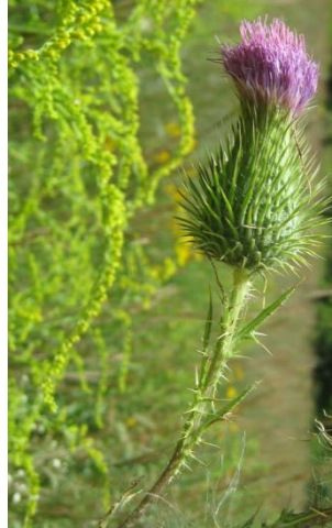
Bull Thistle, showing spiny stem. Flower heads are larger & fewer than Plumeless Thistle.