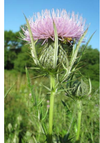
Field Thistle, showing smooth stem and whitish leaf undersides.