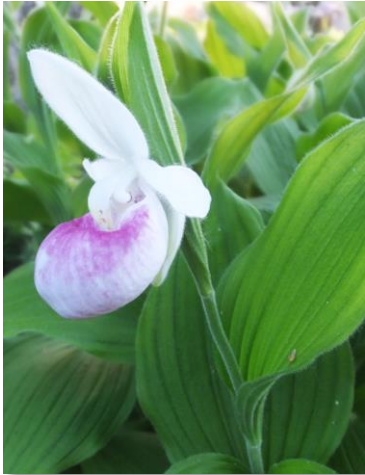
Unique slipper shaped flower with bright white petals

Plant Name: Showy Lady's-slipper ( Cypripedium reginae )