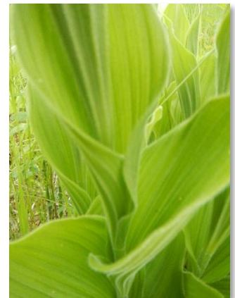
Wide leaves with long horizontal ribs

The plants grow from upright, hairy stems that have alternating leaves and one to three flowers at the end of stems. The flowers are six parted, having a slipper shaped "labellum" about two inches long that is a combination of white and deep purple to magenta (rare pure white versions also occur), and petals and sepals that are white and flat. Flowers also have a green floral bract.