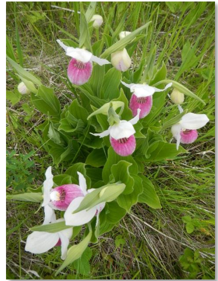
An individual clump with multiple stems and flowers

The species has tiny seeds that lack a seedcoat and germinate in association with fungi that aid the developing embryo by providing nutrients. Due to these characteristics they have been very difficult to grow from seed in the past. Transplanting generally has low survival, and collecting flowers and transplants is illegal in Minnesota. Fortunately new methods of cultivation from seed have made this species commercially available. When planting from containers it is important that sites are selected that have partial shade (sun in morning or afternoon is best) and moist soils. A variety of soil types are acceptable but a neutral pH is most beneficial. It is also helpful to have a fair amount of organic content in the soil and fertilization may be needed periodically, or slow release fertilizer applied early in the season. Fertilizer specially made for orchids or products with organic ingredients is recommended. Newly installed plants also need periodic watering. New plantings should be inspected frequently to spot problems with mold, slugs, bacteria and fungi. Even in good conditions it may take several years for plants to flower the first time.