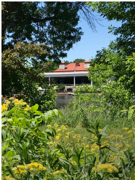
Rain gardens such as this one at Como Park Zoo and Conservatory in St. Paul are among the practices currently used to treat urban stormwater runoff.

They are: best management practices’ cost effectiveness, characterization of stormwater runoff (what’s in it, where is it coming from, can it be monitored more effectively), pollutants of concern (sediment, nutrients and chlorides), pollution reduction practices, innovative practices, improved maintenance of practices, behavior modification, and stormwater management policy.