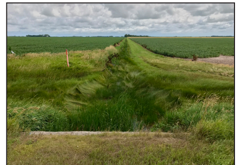
Left: A couple of miles south of the Clay-Wilkin county line in Wolverton Township, narrow buffers are visible in the upstream (east) view of Wolverton Creek. Middle: At a future buffer site, drowned-out crops border the stream channel. Right: Tall grass nearly obscures Wolverton Creek at Wilkin County Rod 3/170th Avenue in Mitchell Township, where the creek cuts a thin line between fields.