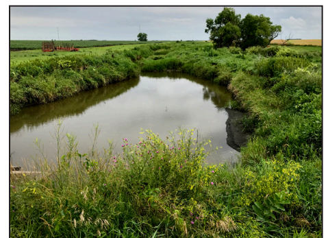
Left: Willow trees frame an upstream, easterly view of Wolverton Creek in Clay County’s Holy Cross Township, about an eighth-mile from the Red River. Along this 2.5-mile stretch, grant funds the Clay County Soil & Water Conservation District received in 2007 were used to remeander the stream.