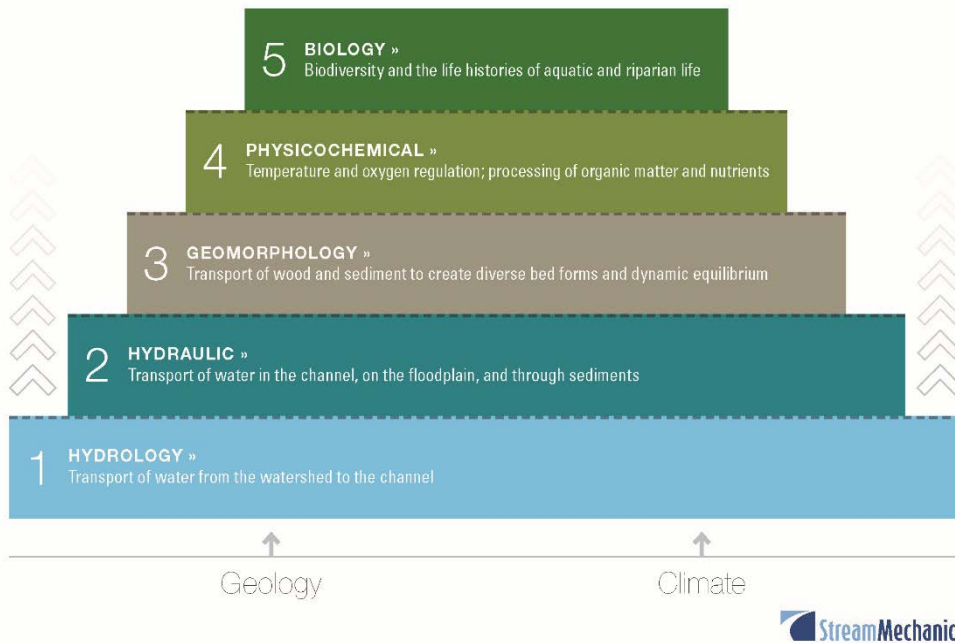
Figure 1: Stream Functions Pyramid

The full framework includes function-based parameters within each functional category to assess and provide information about the functional statement. For example, floodplain connectivity is a function-based parameter within the hydraulic functional category, and provides information about flood-water inundation of the floodplain as well as the spatial extent (e.g. width) of flooding. The specific metrics used to quantify the regularity and extent of flooding are the bank height ratio and entrenchment ratio. These are called measurement methods. They can include a wide variety of assessment methods that quantify the function-based parameter. As is shown here, there can be more than one measurement method per function-based parameter.