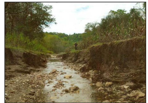
Flood damage from a single-day event in 2016 washed out part of a township road, left , and, elsewhere in the watershed, middle and right , carved a gully a half-mile long and 2 feet to 12 feet deep.