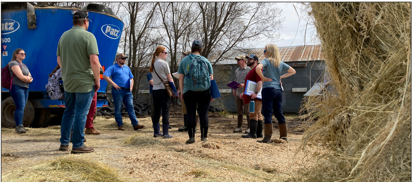
NRCS and SWCD staffers new to conservation engineering got a look at a feed storage pad during the May 10 field visit to a Morrison County dairy farm.

That afternoon, the group toured livestock holding facilities, compared manure storage types, and discussed what sorts of concerns a landowner might have. While standing atop a water and sediment control basin