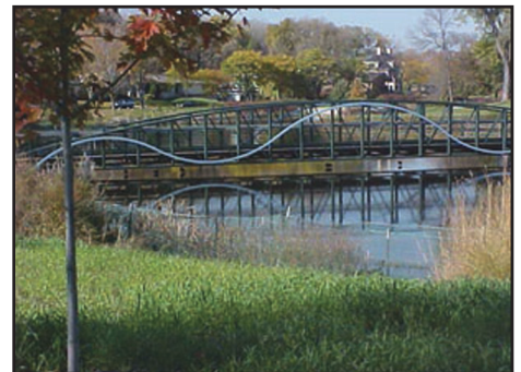
Lake Calhoun pond restoration - Minnehaha Creek Watershed District.

* Note: For districts wholly in the seven-county Twin Cities Metro Area, towns and municipalities jointly or severally within the district submit at least three nominees for each manager's position to be filled. The county board appoints the managers from this list. The county board may select managers from towns and municipalities if a list is not submitted.