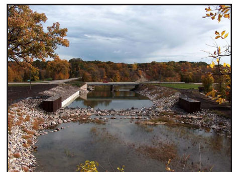
Heiberg dam - Wild Rice Watershed District.