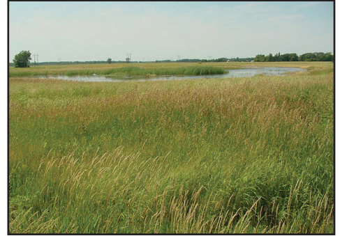
Vesledahl wetland restoration - Sand Hill River Watershed District.