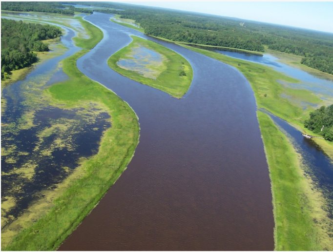
Aerial Corridor Imagery