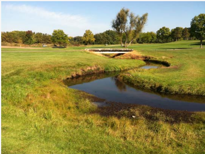
Browns Creek in need of restoration