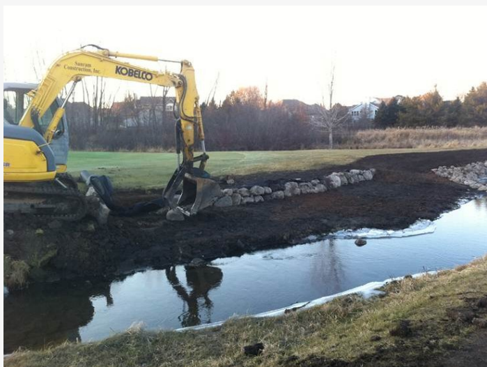
Browns creek restoration in progress