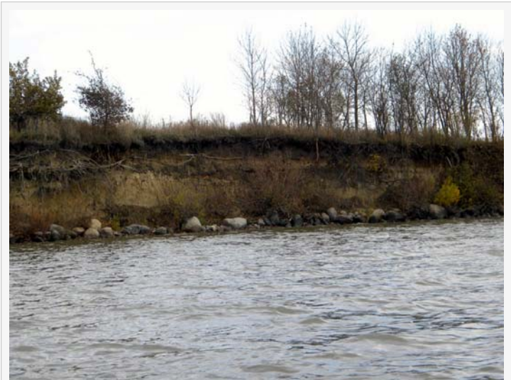
Sloughing Shoreline on Lake Ocheda