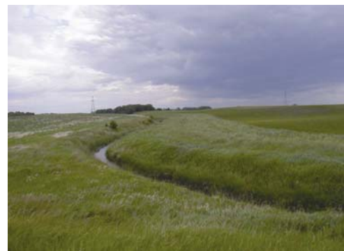
Fig. 3: Riparian buffer