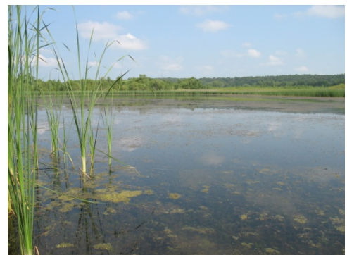
Fig. 2: Wetland restoration