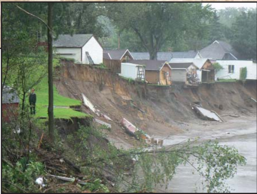
1 August 2007: Garvin Brook, in Minnesota City, Winona County.