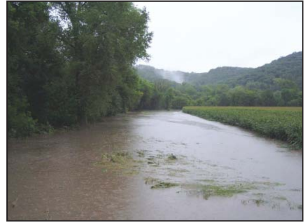
Flood-prone riparian areas like these in Winona (top) and Houston (bottom) counties were high-priority lands for the special RIM signup.

BWSR received additional RIM Reserve dollars during the 2008 Legislative Session, and enrolling flood-damaged riparian lands in the next RIM signup will be a high priority.