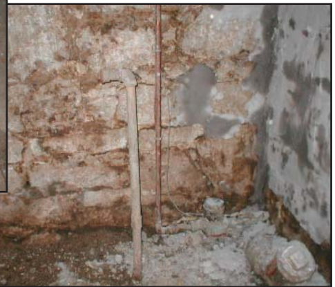
Pictured: (above/right a typical sand point well project), and (lower right) a larger scale well sealing project.