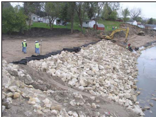
2 September 2007: State and federal funding is authorized, and project is underway.

3 October 2007: A streambank stabilization project on Garvin Brook in Minnesota City was completed less than three months after one of the most severe flooding events in Minnesota history. Estimated cost was $631,000, including $473,000 in federal funding through USDA Natural Resource Conservation Service (NRCS) + $158,000 state through the Board of Water and Soil Resources. SE Minnesota received 8-20 inches of rain over three days, including more than 15 inches of rain in 24 hours in some areas. This is the largest total ever recorded by an official of the National Weather Service reporting location in Minnesota.