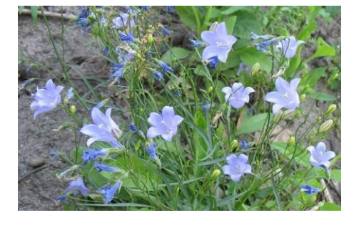
Bellflower has a similar flower to Jacob's ladder, but lacks the compound leaves.