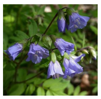
Flowers bloom in spring on weak stems.