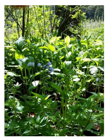
Jacob's ladder grows with other woodland forbs in partial shade.