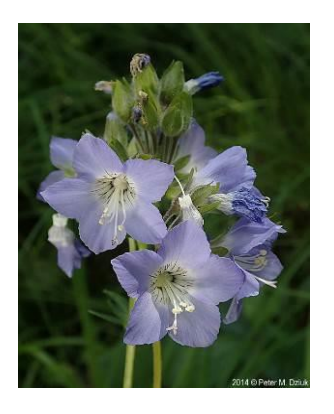
The petals of Western Jacob's ladder have pointed tips.