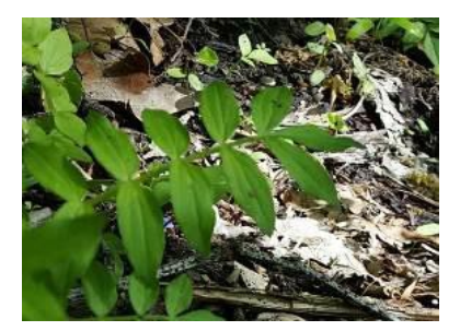
Leaves have opposite leaflets.