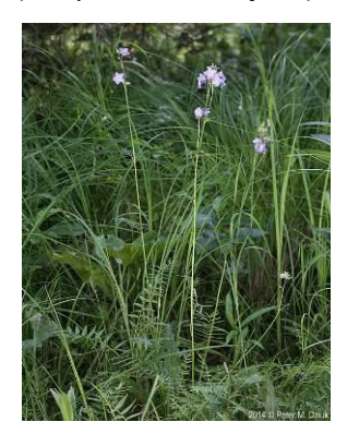
Tall flower stalks support Western Jacob's ladder.

Western Jacob's ladder has taller flower stalks and more pointed petals than spreading Jacob's ladder. Bellflower ( Campanula rotundifolia ) has similar flowers but lacks the compound leaves (it has grass-like leaves).