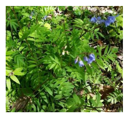
Spreading Jacob's ladder typically is found in moist shady spots.

Spreading Jacob's ladder emerges from the forest floor in early spring and blooms in late April and May. This herbaceous perennial plant grows 10 to 20 inches tall depending on conditions, and thrives in moist, shady habitats of southeastern Minnesota. The common name refers to the pairs of opposite leaflets said to resemble a series of steps on a ladder seen in a dream by the biblical Jacob. The specific epithet reptans is Latin for "creeping" or "crawling." Like other spring wildflowers, it provides important early season sources of pollen and nectar for pollinators.