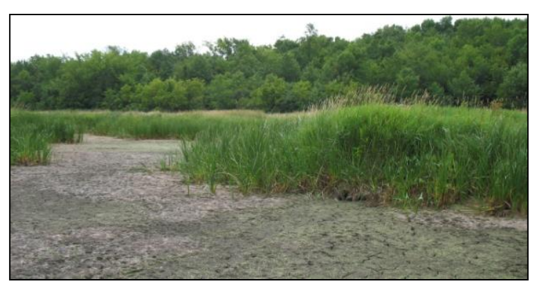
Drawdown allowing for invasive weed control

Ideally, shallow to deep water wetlands will benefit from being disked once every five years or so. Disking is usually conducted (if invasive species establishment is not a threat) to aerate the soil to encourage plant growth of native species from the seedbank. Disking can also help control the establishment of undesirable wetland plants including cattail and woody species. Disking late in the summer will usually provide the best results for vegetation control.