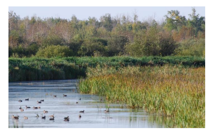
Ducks feeding in shallow water

and the first week of April. Shorebird migrations usually continue through the first week of June. This springmanagement sequence is compatible with waterfowl, since deeper water habitats are available during peak duck migrations in late February or March. The shallow areas created by the initial drawdown for shorebirds also are attractive to most late migrant puddle ducks, such as shovelers and teal. Disking, followed by shallow flooding in July, will provide excellent shorebird areas. Flooding up to a 3-inch depth creates a habitat that is used almost immediately by migrant shorebirds. Table 4 summarizes expected response by bird species to seasonal water level manipulation.