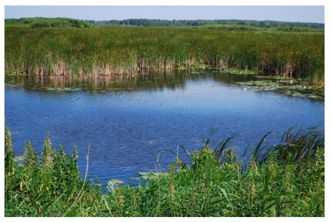
Changes in water levels is a natural occurrence in many depressional wetlands

Fluctuations in water levels through occasional periods of drought or late summer conditions can be important natural events for wetlands and the functional benefits they provide. Low water levels can provide the opportunity for regeneration and increased diversity of wetland plant communities, aquatic organisms, and improved fish and wildlife habitat. In many locations, natural or seasonal drawdown of wetland water levels will occur and these regular water level disturbances can achieve adequate management results. In other cases, the artificial drawdown of the wetland will be required to achieve the desired management results.