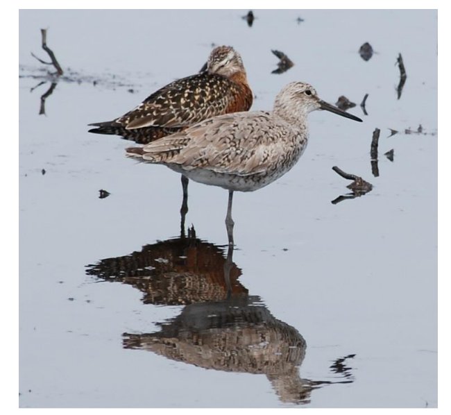
Shorebirds attracted to mudflats in a Murray County wetland

For most drawdowns, wetland water levels should be dropped at a slow rate. The recommended removal rate will vary with each situation but a general goal of about one inch per day should be attempted. Slower drawdowns tend to improve diversity of plant