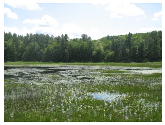
Shallow lake with diverse aquatic vegetation

The frequency of drawdowns should be planned to mimic natural water level fluctuations and is largely dependent on watershed size, outlet capacity, and weather, as well as the shape and size of the basin itself. A prairie pothole in the upper reaches of a watershed, for example, typically has a small contributing watershed and no discernible outlet. Water levels are likely to vary seasonally with the deepest water occurring in spring followed by the lowest levels in late summer. Water levels going into winter are dependent on fall rains. Relatively mild year-long droughts may dry out both surface water and underlying soil moisture for the entire cycle.