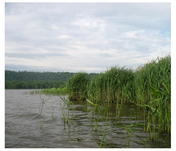
River bulrush and broad-leaf arrowhead on the edge of a marsh

A typical annual wetland water budget in the upper Midwest reflects snowmelt and abundant precipitation in the spring, moderate rainfall in early summer, little rainfall in late summer, and moderate precipitation in fall. This typical cycle varies widely, however, with changing weather events. A dry spring and early summer encourages the germination and growth of emergent wetland plants. Bulrush species tend to act as cool season plants, responding well to mudflats early in the growing season. Cattails, on the other hand, respond more like warm season plants with the greatest gains in germination and growth during mid to late summer. Lower water levels throughout the growing season benefit submergent wetland plants by increasing the available sunlight throughout the water column. Lower water levels also benefit foraging birds. Early to midsummer is a critical time for fledgling survival and