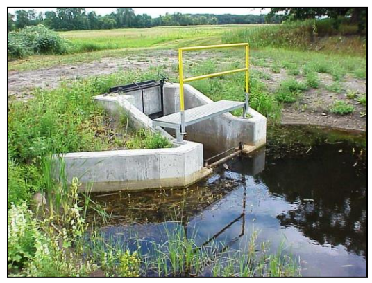
Wetland outlet that can be used to control water levels

Drawdowns can influence a wide range of wildlife species, so it is important that experienced resource managers are involved in all phases of planning and management.