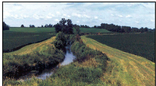
Ditch Buffer Strips

Summary: This subdivision requires public drainage systems to establish minimum 16.5 ft. wide ditch buffer strips of perennial vegetation (preferably native vegetation of a local ecotype) when viewers are appointed to determine drainage system benefits and/or damages, and to acquire the associated permanent right-of-way easement. For existing drainage systems, the types of proceedings that require the appointment of viewers include establishment, improvements, improvement of an outlet, laterals, redetermination of benefits and damages, or certain types of petitioned repairs that require determination of benefits and/or damages.