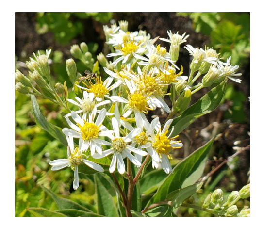
Leaves of the flat-topped aster are alternate, and flowers are ray with yellow center disks.

to heart-shaped, with petioles growing a half-inch to 2.5 inches long. Although flat-topped aster ( Doellingeria umbellata ) leaves are similar, they are alternate, and the florets are rays with yellow center disks.