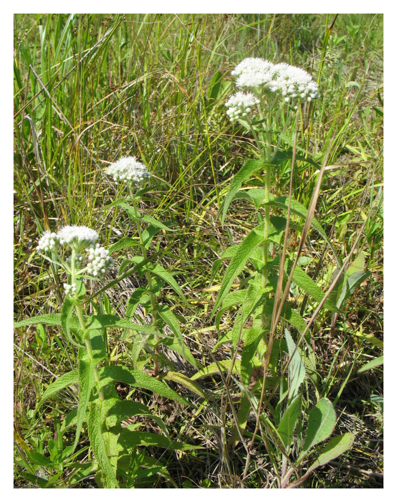
Boneset grows in a restored wet meadow.

Flowers produce nectar that attracts pollinators including bees, wasps and butterflies. The fragrant, showy flowers are used in fresh or dried arrangements. When planted with wetland grasses and sedges, boneset provides late-summer accents. It helps to control erosion, and is useful in stormwater retention basins and rain gardens. In the past, a tea made from dried plant parts was used to treat a variety of ailments.