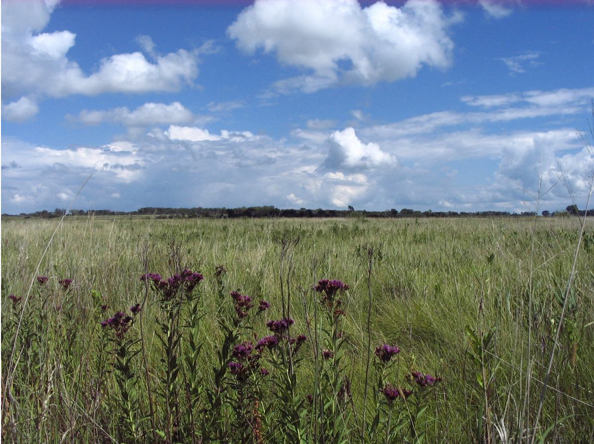
The RIM Grassland Reserve Program aims to protect remnant native prairie such as this Kittson County property. Because grasslands and remnant prairies are more easily converted to cropland, they are more at-risk for development than are forestlands or wetlands.