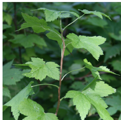
Currants are shrubs with alternate, palmately lobed leaves. Depending on the species, the margin has pointed or rounded teeth. This is wild black currant, Ribes americanum .

have small, yellow resin glands on one or both leaf surfaces. Currants bloom from May to June with two to 18 five-parted flowers in upright, arching or drooping clusters. Fruits are red or blue-black berries a quarter-inch to a half-inch in diameter, some with glandular hairs, maturing from June to September.