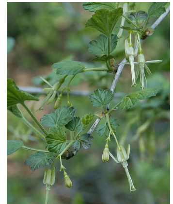
From left: Currant flowers are a high-priority food source for the endangered rusty patched bumblebee. This is wild black currant, Ribes americanum . Photo Credit: Peter Dzuik, Minnesota Wildflowers Gooseberries are related plants with prickly stems. Only one currant, prickly currant ( Ribes lacustre ) has similar stems. This is prickly gooseberry, Ribes cynosbati . Photo Credit: Peter Dzuik, Minnesota Wildflowers Currants typically have many flowers in clusters called racemes. The racemes of this skunk currant ( Ribes glandulosum ) are upright. Other species have drooping racemes. Photo Credit: Mark Garland, USDA Natural Resources Conservation Service Plants Database In contrast to currants, gooseberries have few flowers per cluster, typically one to three. This is Missouri gooseberry, Ribes missouriense . Photo Credit: Katy Chayka, Minnesota Wildflowers

Minnesota’s five species of native currants are small or medium shrubs found throughout the state, typically in wet or moist soils of both upland and lowland habitats. They are