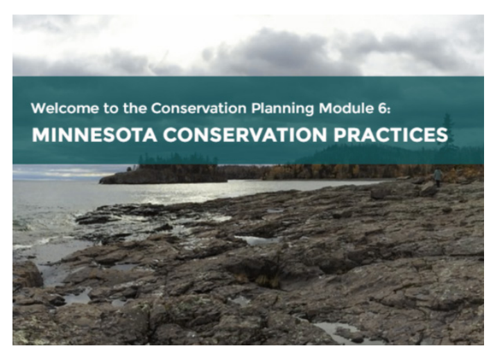
Cover slides depict Core Competency Conservation Training modules. Nineteen modules are offered by the new training series.