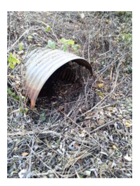
A field survey will determine the geometry and critical elevations of existing structures within the affected reach of the outlet, such as culverts.

All hydrologic and hydraulic analyses will require some level of field survey information reflecting existing outlet conditions. An office review of aerial photographs of the outlet and state-wide LiDAR topography will indicate locations where field survey data should be collected. Depending on the anticipated significance of outlet impact, the following information is considered a minimum requirement for a field survey: