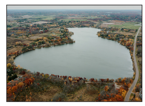
From left: A Clean Water Fund grant awarded to the Shingle Creek Watershed Management Commission supported an alum treatment on Pomerleau Lake in Plymouth. Kohlman Lake is the first lake in the Phalen Chain of Lakes. The Ramsey-Washington Metro Watershed District and its partners completed projects that contributed to water-quality improvements. The Comfort Lake-Forest Lake Watershed District's water-quality improvement work has focused on a 5,586-acre drainage area affecting Bone Lake.

grant awarded in 2012. Work finished in 2014. Now, stormwater runoff from 915 acres irrigates 116 acres of the golf course. RCWD provided matching funds; Hugo provided in-kind support.