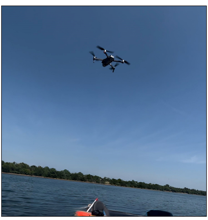
Aitkin County SWCD Forester Kyle Fredrickson flew a drone around the perimeter of Mille Lacs Lake to capture video footage in summer 2023.

The Aitkin County SWCD created a scoring system, which it used to prioritize