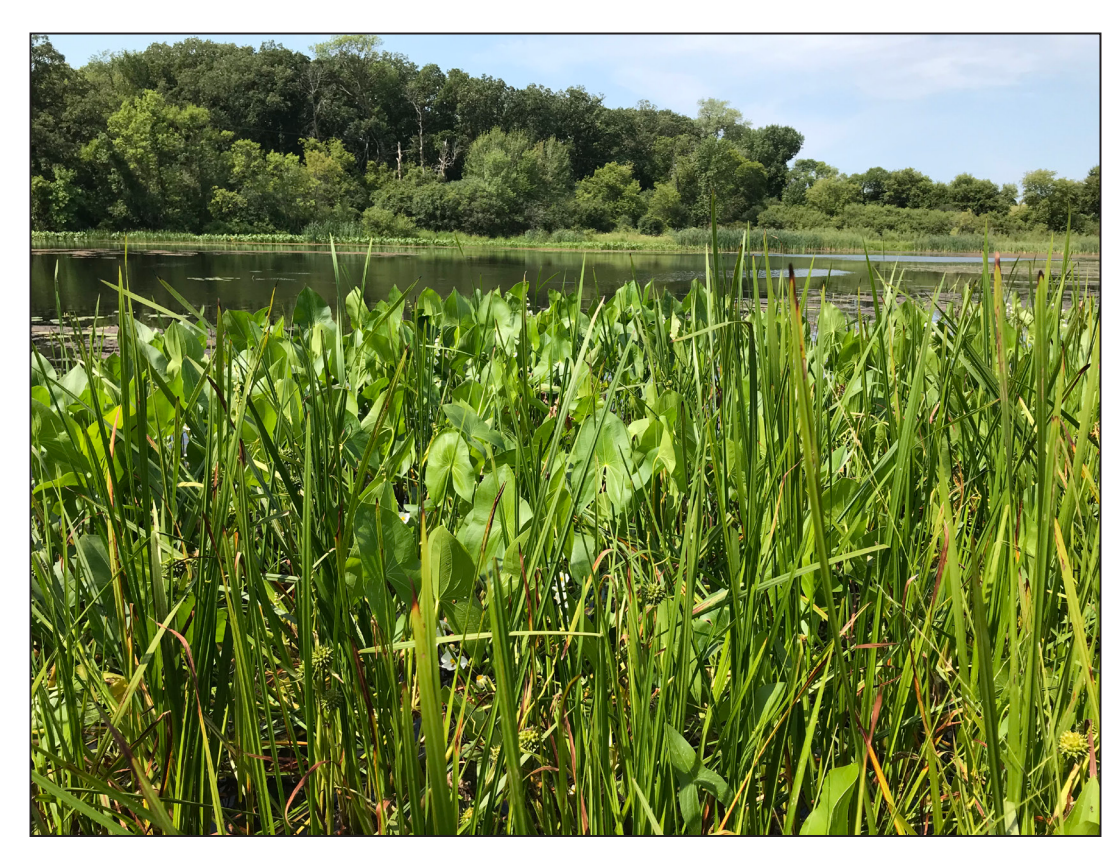
Wetland restorations — such as this one in Pope County — help to increase water storage, improve water quality and enhance wildlife habitat.

The tool's five sections will cover typical wetland restoration components and common maintenance issues: general/vegetation, embankments, pipe outlets, open spillway outlets and drainage systems. Each section will contain a brief description of the structures, along