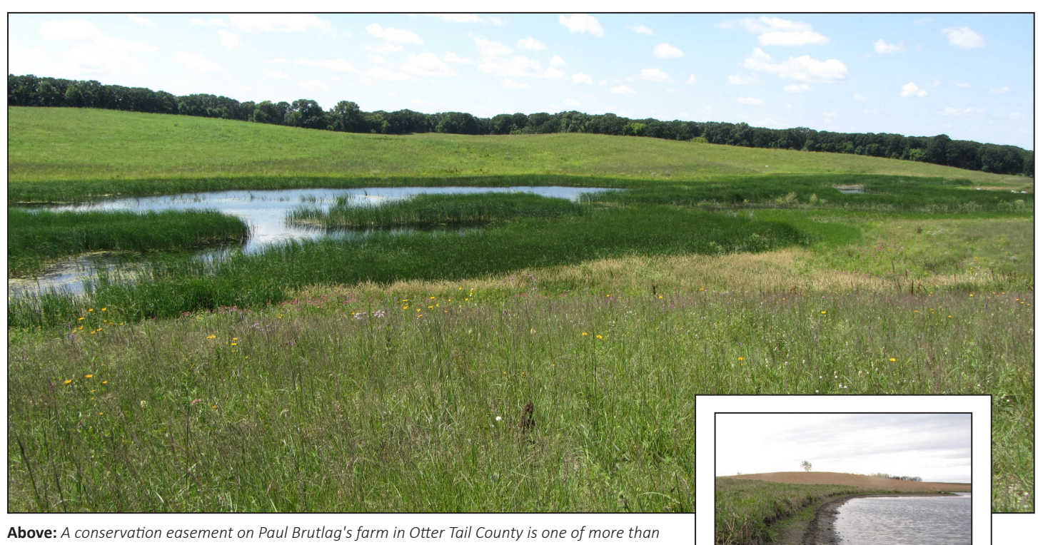
Above: A conservation easement on Paul Brutlag's farm in Otter Tail County is one of more than 8,000 easements across the state that include wetland restorations. A new tool being developed by BWSR will help soil and water conservation district staff track the condition of structural components included in restored wetlands. Right: A restored wetland sustained wave damage along an embankment.

new online tool being developed by the Minnesota Board of Water and Soil Resources (BWSR) will help track the condition of structural components — such as embankments, pipes and weirs — incorporated into wetland restorations that are part of conservation easements across the state.