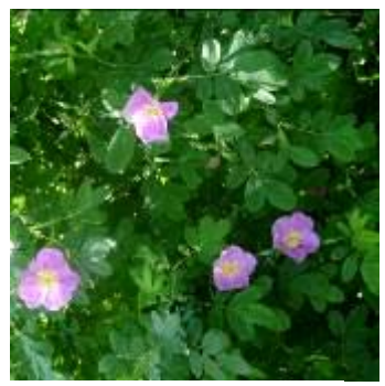
The branches of the Smooth Wild Rose, especially the newer growth are almost free of thorns and prickles.