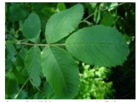
Smooth Wild Rose stems typically have between 5-9 leaflets.

Rosa blanda can be recognized by its striking flowers, which are between two and three inches wide and have five pale to deep pink petals. The flower stalks and young branches are typically smooth and green in color. Lower, older stems tend to darken to a maroon or purplish color and develop a covering of stiff and spiky prickles. Smooth Wild Rose has alternate leaves with about seven leaflets that are 1-1.5 inches long and slightly less than an inch wide. In late summer, the flowers develop into rose hips (small spherical fruits about .5 inches wide) which eventually turn red.