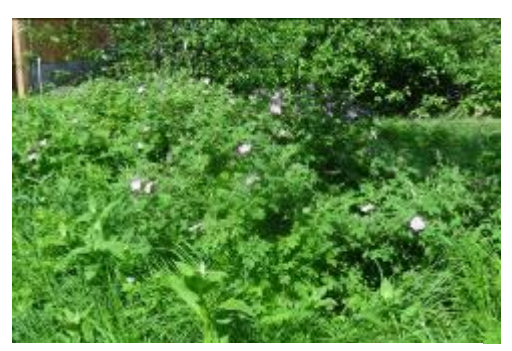
Smooth Wild Rose in a stormwater planting

high in vitamin C and antioxidants. Rosa blanda and other wild roses also attract large numbers of native bees and bumblebees and provide nesting habitat for these species. Smooth Wild Rose can also provide effective soil stabilization along waterways as it forms an extensive root system. It can be used in stormwater plantings but can spread underground and may not be suited to small raingardens where it can outcompete other vegetation.