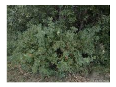
From left to right: Similar species include the Prairie Rose (Rosa arkansana,, Prickly Wild Rose (Rosa acicularis,), and Wood's Wild Rose (Rosa woodsii,). Prairie Rose and Prickly Wild Rose have prickles on newer stems that differentiate thme from Smooth Wild Rose. Wood's Wild Rose is very similar to Smooth Wild Rose but can have a pair of prickles where leaves attach to the stem.

Minnesota Wildflowers: <a href="https://www.minnesotawildflowers.info/shrub/smooth-wild-rose">https://www.minnesotawildflowers.info/shrub/smooth-wild-rose</a> Eloise Butler Wildflower Garden: <a href="http://www.friendsofthewildflowergarden.org/pages/plants/smoothrose.html">http://www.friendsofthewildflowergarden.org/pages/plants/smoothrose.html</a> Canadian Wildlife Foundation: <a href="http://cwf-fcf.org/en/discover-wildlife/flora-fauna/flora/wild-roses.html#species?referrer=http://cwf-fcf.org/en/discover-wildlife/flora-fauna/flora/wild-roses.html?referrer=https://www.google.com/</a>