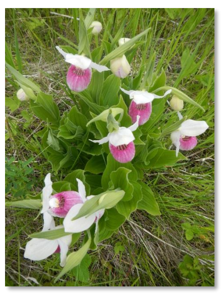
An individual clump with multiple stems and flowers

these characteristics they have been very difficult to grow from seed in the past. Transplanting generally has low survival, and collecting flowers and transplants is illegal in Minnesota. Fortunately new methods of cultivation from seed have made this species commercially available. When planting from containers it is important that sites are selected that have partial shade