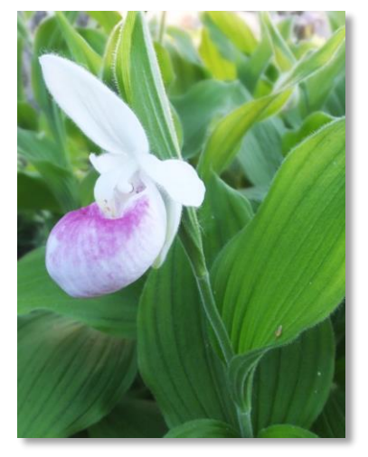
Unique slipper shaped flower with bright white petals

Plant Name: Showy Lady's-slipper (Cypripedium reginae)