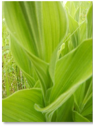
Wide leaves with long horizontal ribs

The flowers tend to bloom in June and July, lasting about one to two weeks. The leaves are elliptical in shape, hairy, ribbed and clasp the stem.