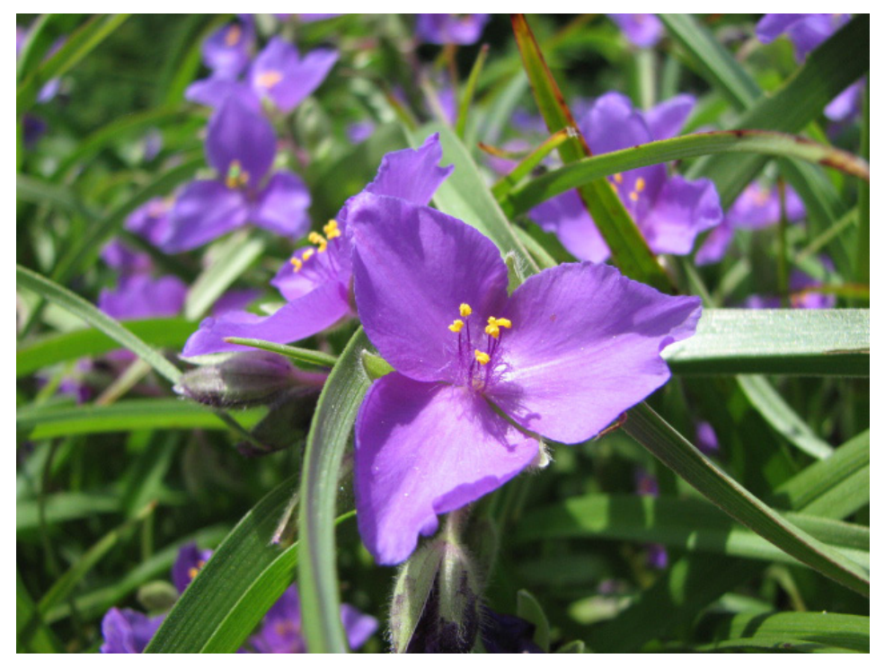
Prairie spiderwort is commonly used in native plantings. It flowers from late May through early July.

Plant family: Spiderwort (Commelinaceae)